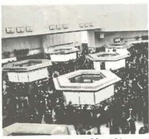
We can advise you on all areas of financial investment.

Although The Hongkong Bank Group originated in Asia, we have always had a very international outlook. Much of the financial support for overseas investment and trade by Asian companies doing business outside Asia has come from us. If your company is interested in establishing or building up its business anywhere throughout the world, you should consider using the accumulated knowledge, understanding and resources of The Hongkong Bank Group.